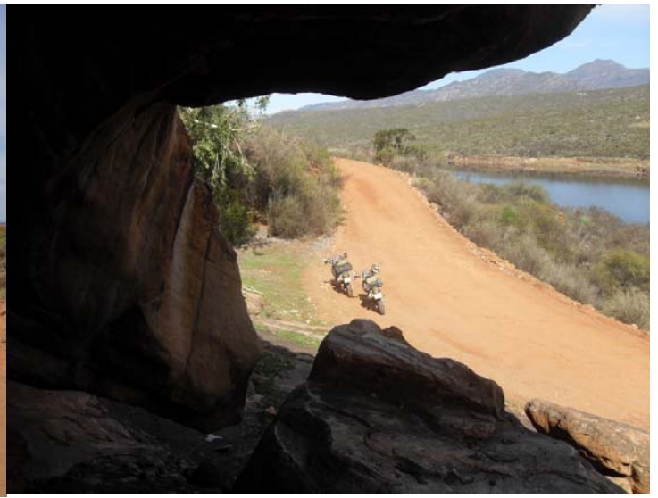
Klawer dirt road to Clanwilliam.....