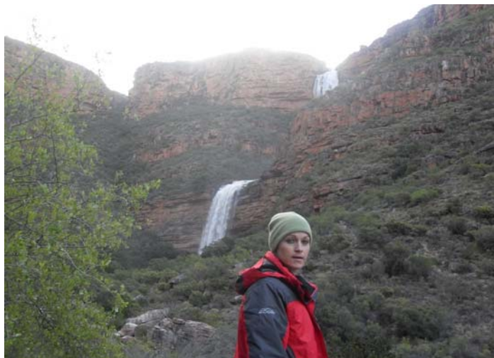
Ground level of the Waterfall