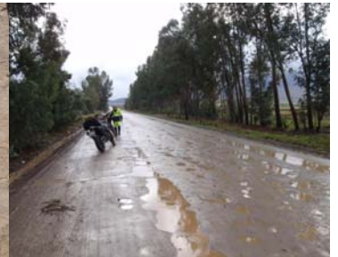
Waterval Resort Vanrhynsdorp Dirt Weekend Adventure!!