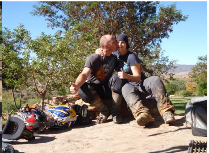
The face of a happy Dirt-Chick, sitting in pure happiness!!!