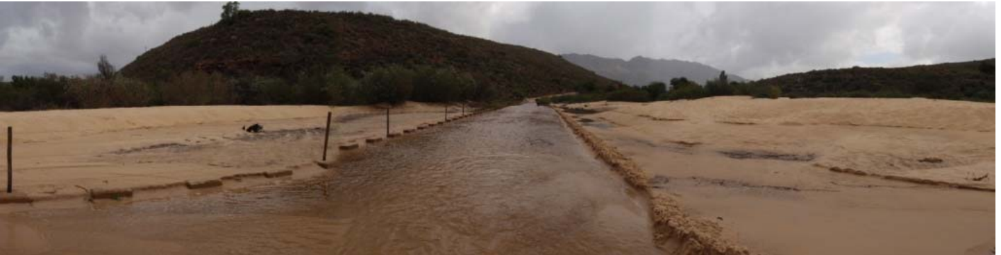
Flooded Algeria Turn Off river crossing!

It was wet and muddy, just the way I like it. My mood changed suddenly and I started to enjoy the trip. Im in the place I enjoy most, in nature. The road was tricky at places but the more you ride it the more you get used to it and become better at each ride out. I felt good. I enjoyed my bike and to ride again after a long time. We made one stop just before the Algeria turnoff bridge. A flooded river crossing awaited us. Knee deep in height. We thought, a new challenge, we drove the length [110m] of the flooded river crossing. What an amazing experience. What a load of joy.