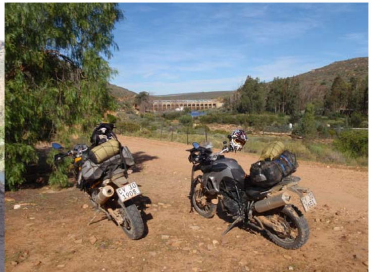
Klawer dirt road to Clanwilliam