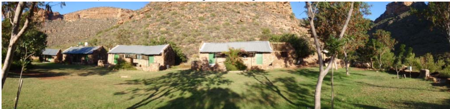
Waterval Resort Cottages, our stay over en-route to Namibia 2011.

The surrounding area is refreshing. My head were clear, I had nothing I could think about just the ride out, the fun in the mountain, the beautiful waterfall, the joy being with Emile and the fun we have. This specific weekend we just wanted to be alone, we missed our friends and especially Captain Chaos in particular as he would have enjoyed the mud roads extremely but then again, a good thing we decided on not calling him as it might have been a wild one for him to experience but fun for us. Next time Captain Chaos I promise. We relaxed the rest of the day with the resort sheep following us where we go and the cat that slept with us the whole weekend.